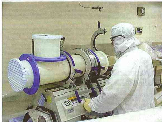
JBH Clean Room

The company has grown during the past 52 years from a small, two-man architectural services firm to a large general and mechanical contracting company with an international presence.