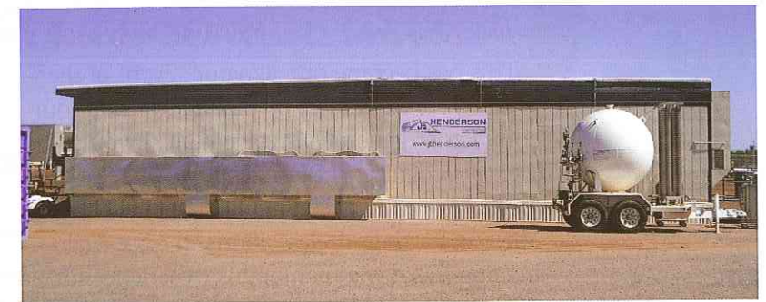
JBH job trailer in Chandler

JBH's Arizona operations strongly benefit from its relationship with Local 469, which ensures that the company provides its customers with the most experienced personnel in the industry. JBH currently employs 125 Local 469 workers,